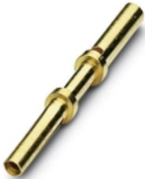
Crimp contact, turned, contact diameter: 0.6 mm, crimp range: 0.06 mm 2 ... 0.25 mm 2

Please be informed that the data shown in this PDF Document is generated from our Online Catalog. Please find the complete data in the user's documentation. Our General Terms of Use for Downloads are valid ( http://phoenixcontact.com/download )